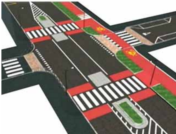
Pedestrian and Cycle Crossing