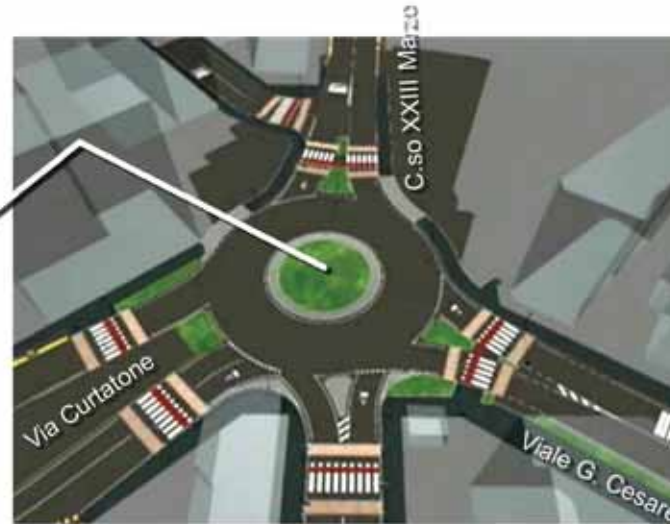
Traffic Circle EL ALAMEIN