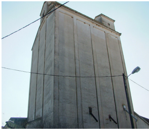
An ancient silo will be develop like art museum