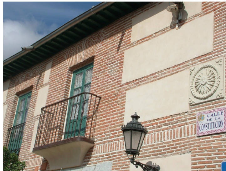
Recover of old houses